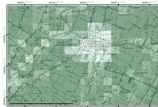
(A) Agricultural GVA