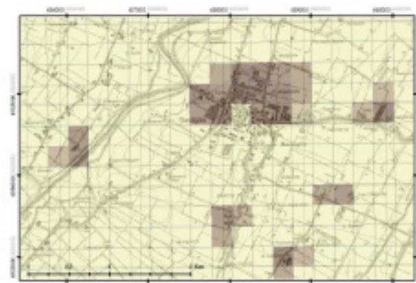
(B) Industrial GVA